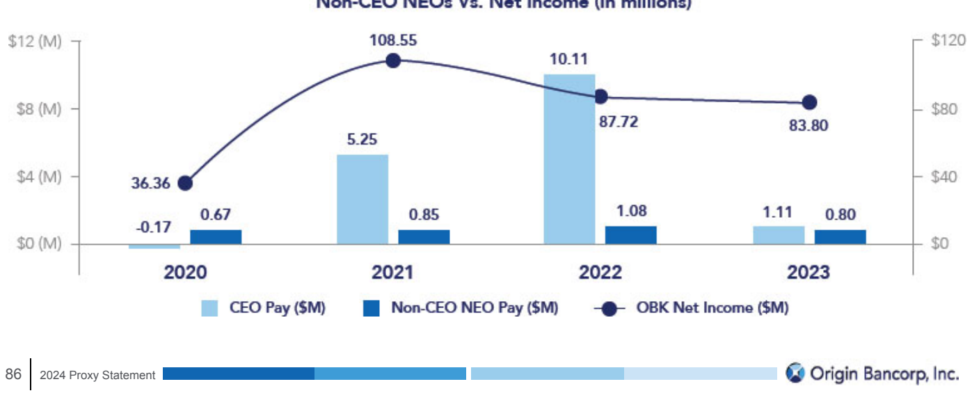
Compensation Actually Paid to CEO and Average Compensation Actually Paid to the Non-CEO NEOs Vs. Net Income (in millions)

The graph below describes the relationship between compensation actually paid to our CEO and to our Non-CEO NEOs (as calculated above) and our Net Income for the indicated years.